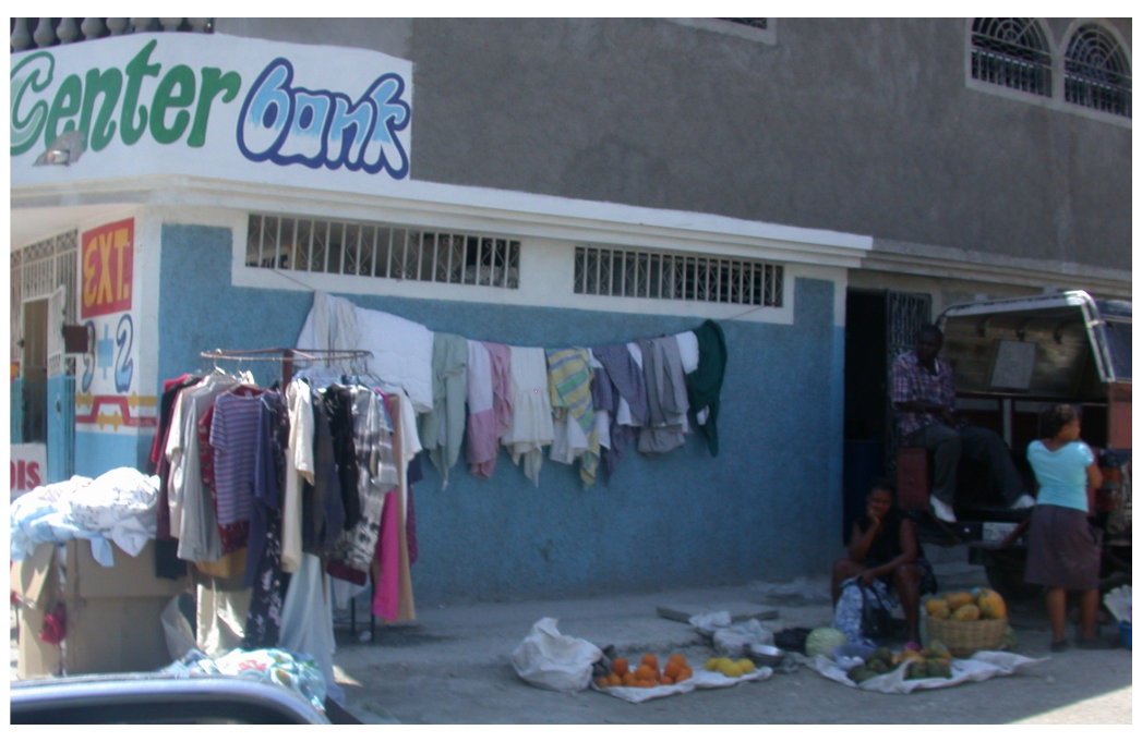
Entrepreneurship - Haitian Style

If we have anything to say about it, the answer is yes!